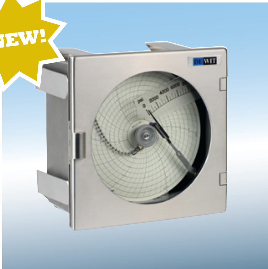
St. steel AISI 316 case 6" Chart Recorder De Wit model 4892SS, panel mount